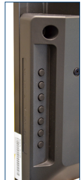
Backside and a view of slim design of ECO-Line 55.