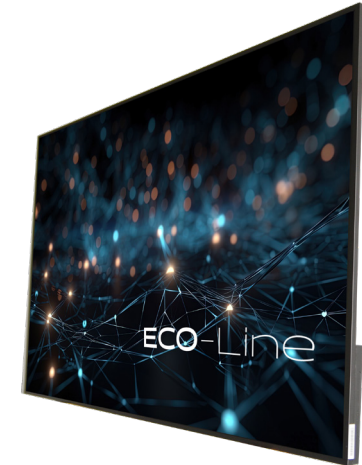
Monitor ECO-Line 55 front view